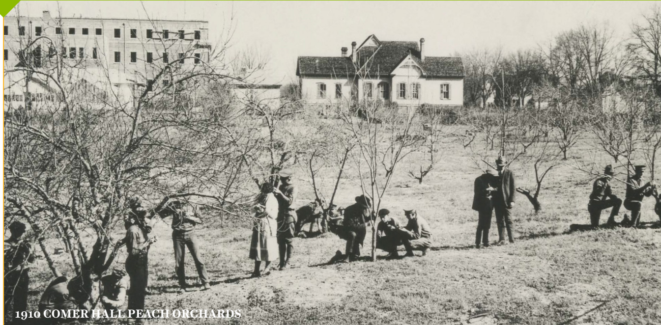
1910 COMER HALL PEACH ORCHARDS

On the south end of the Auburn University campus, a historical marker stands near a small plot of row crops. At the height of growing season, this single-acre piece of land is packed with corn, cotton, soybeans and peanuts.